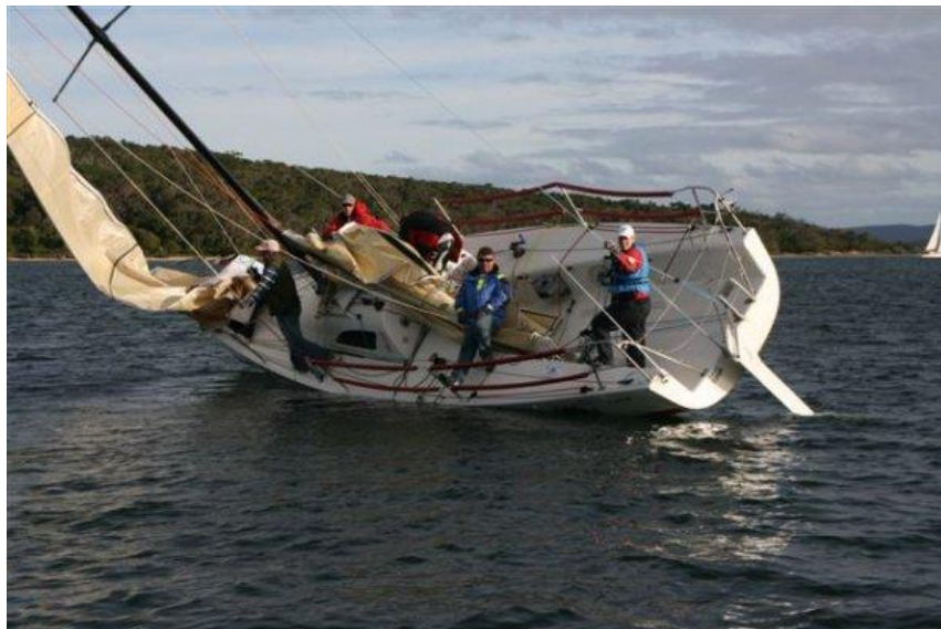
Smile for the camera Jack ☺☺☺

We've had another eventful Winter Series with the Mirrors joining in for the first week when the weather was still very Autumnal and the Flying 15's have joined in every week as well. The most eventful heat was Heat 4 when it was decided to do the Green Island race. As with most Green Island races these days there are a few bumps along the way given the deeper draft of the Bulls & Tigers but when you combine that with a lack of experience navigating around the island it usually ends with a few priceless photos such as this one -